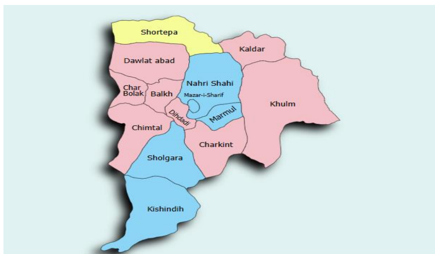
Chart1 : Map of Balkh Province with its districts (PaintMaps, n.d.)